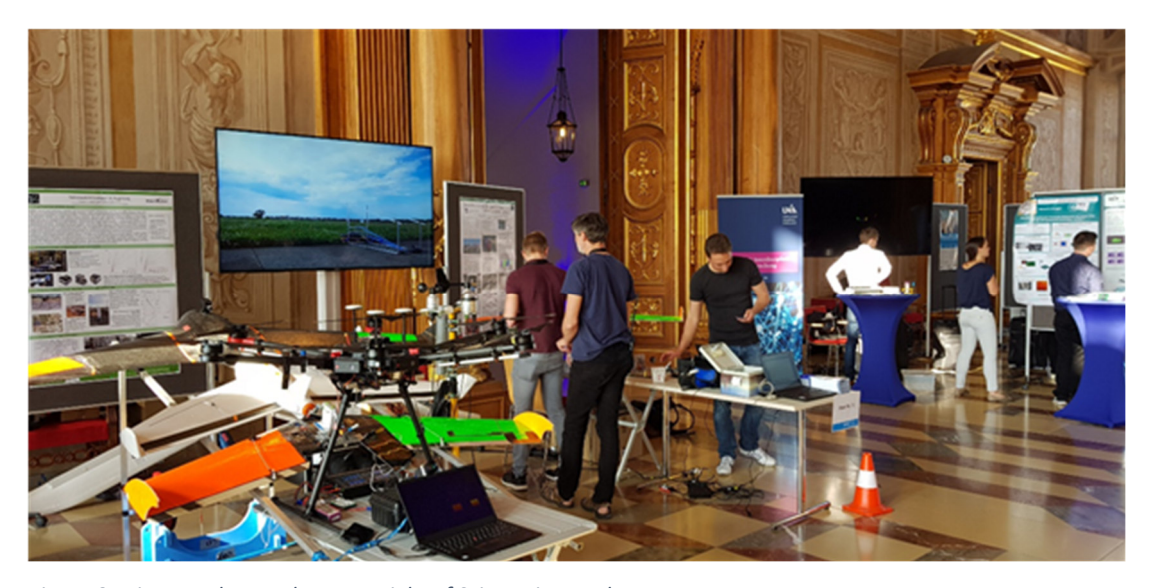
Figure 8: Picture taken at the Long Night of Science in Augsburg

Participation in the SmartAQnet workshop on 07<sup>th</sup> May 2018 in Augsburg. For this purpose, two talks to the planning state of the measuring network in Augsburg were prepared.