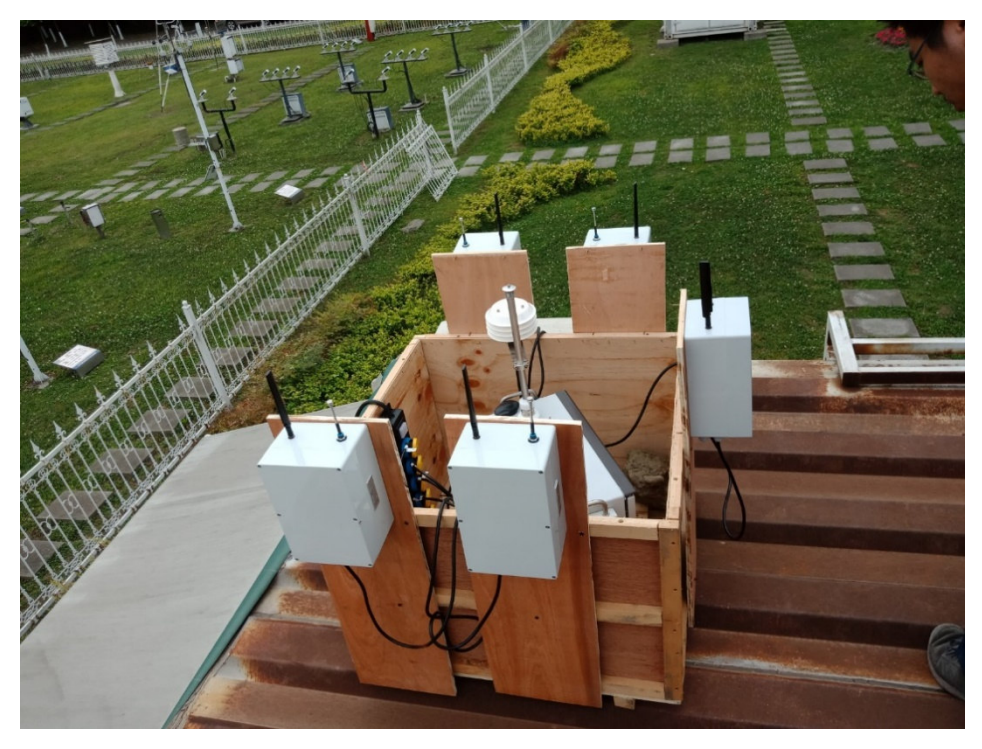
Figure 5: Similar to the intercomparison setup at Augsburg measurement site the installation at Chengdu was carried out