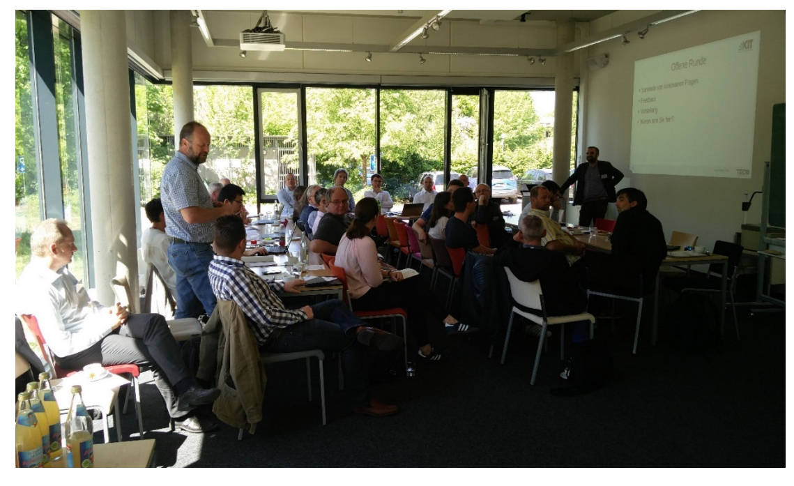
Figure 3: Open discussion at the workshop